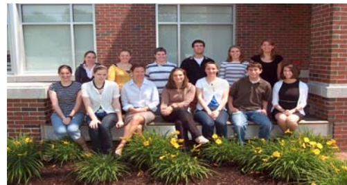
Class of 2008